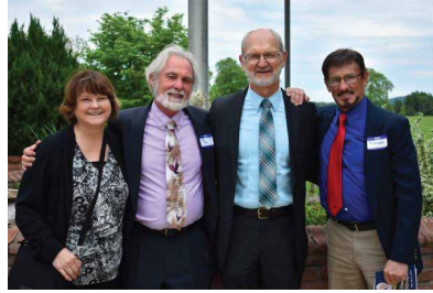
Class of 1974