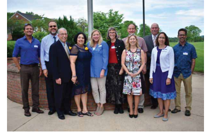
Class of 1979