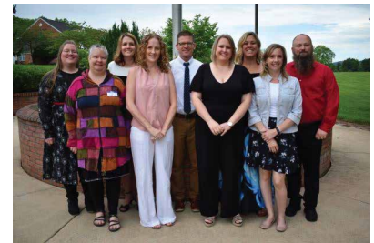
Class of 1999