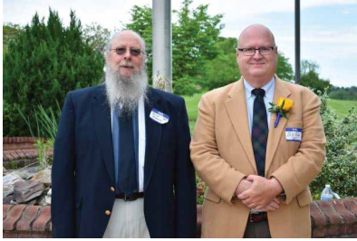
Class of 1969