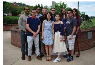
Class of 2014