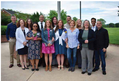
Class of 1989