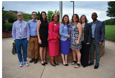
Class of 1994