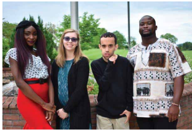
Class of 2009