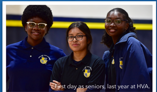
First day as seniors, last year at HVA.