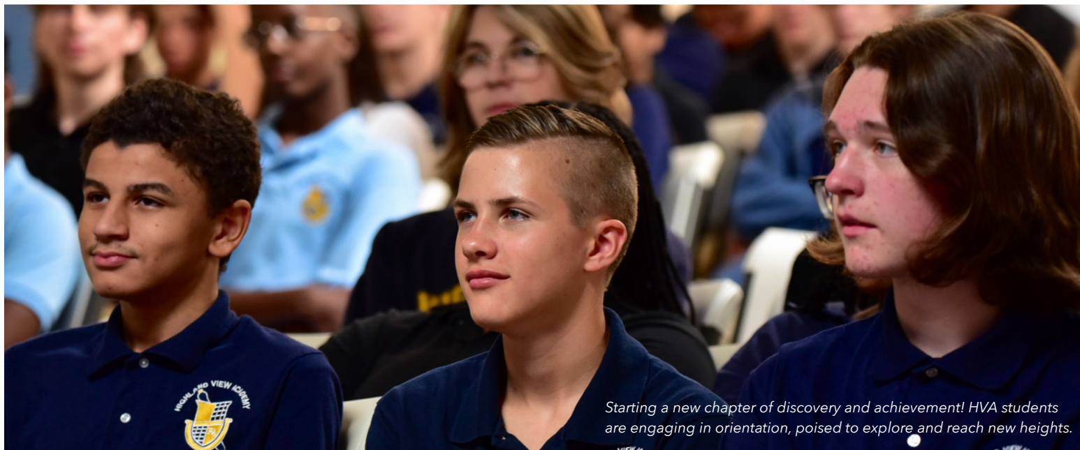
Starting a new chapter of discovery and achievement! HVA students are engaging in orientation, poised to explore and reach new heights.

To inspire and mentor our students to excel in all Christ calls them to do.