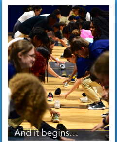
And it begins...